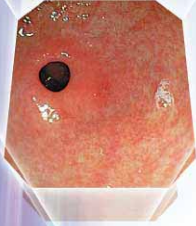
Image quality without compromise — the GIF-Q180 measures only 8.8 mm along the entire insertion tube. This slim design allows smooth insertion into the upper gastrointestinal tract. At the same time, you will enjoy brilliant images that are clear and sharp from edge to edge and displayed on the monitor in a large display size. Versatility and state-of-the-art image resolution combine to make this the ideal solution for today's most exacting procedures.

Combining high quality image with a slim design, this scope is ideal for a wide range of applications in the upper gastrointestinal tract from observation to treatment.