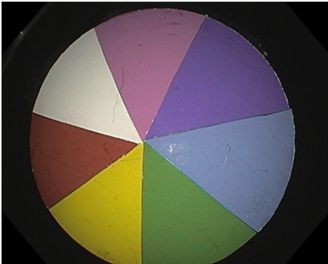
Incorrect color correction data